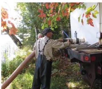
Tom hooks up the hose