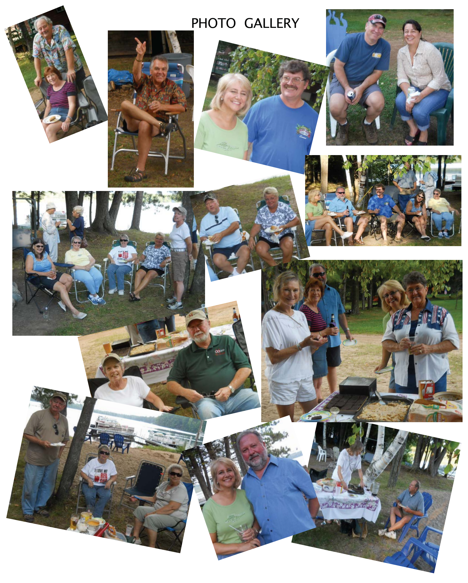
2012 Summer picnic @ Birchwood