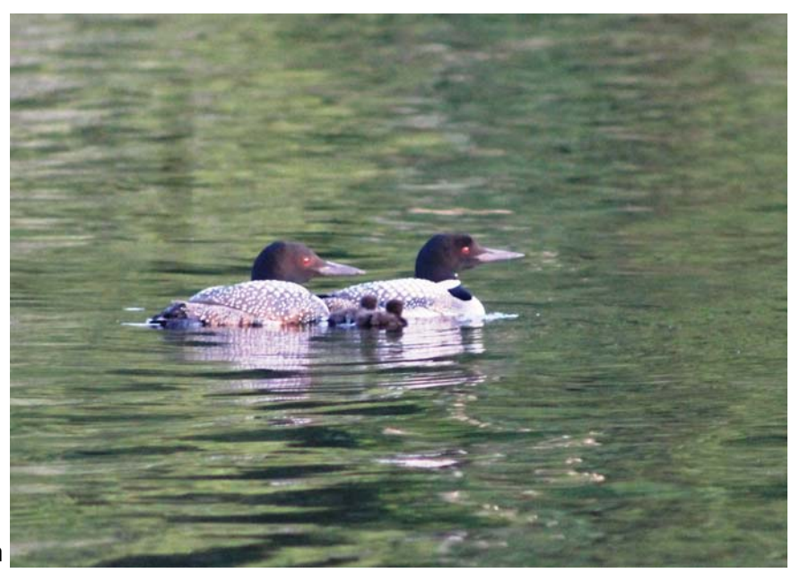
Mom & Pop and two Baby Loons on North Pelican #5

LOON FACTS Common Loons are of five species in the genus Gavia *****