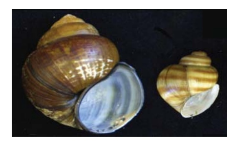
The smaller Banded Mystery Snail

The Chinese and Banded Mystery Snails both form dense aggregations. Both can carry parasites which can cause mortality of largemouth bass embryos when they invade nests.