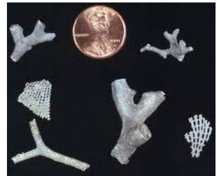
Examples of size

Moen Lake Association PICNIC at the Birchwood BEACH On third lake