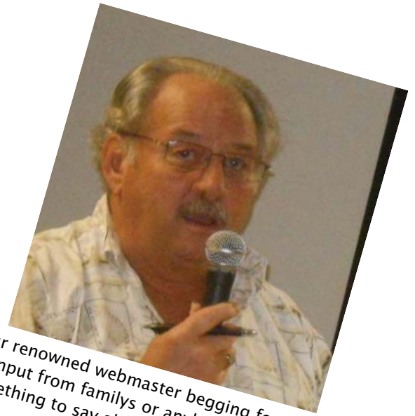
Our renowned webmaster begging for more input from families or anybody that has something to say about history, the Chain or the Association

Most people do not listen with the intent to understand; they listen with the intent to reply.