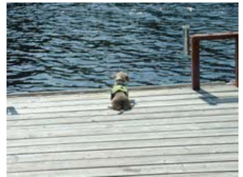
"Woody" Kris Krause's