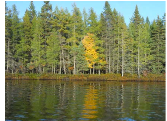
I'm so lonely, (snif!)